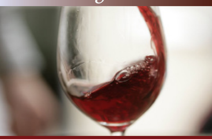
Grasse Institute of Perfumery